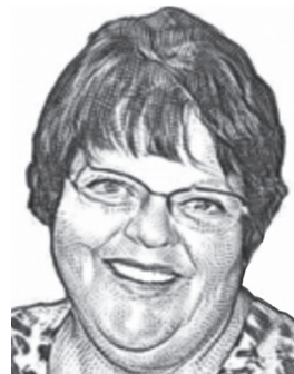
CJ Country Air Personality 10 a.m. to 2 p.m. Monday through Saturday

There's something special about radio. It's immediate, intimate, and endlessly curious—it's a companion to all aspects of your life. Whether you are running errands, working, playing in the snow or sun, will you take me along with you?