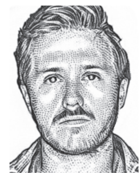
Corey Kent, country music singer

For more information, visit Burley, Berries & Blooms on Facebook or call (814) 648-0178.